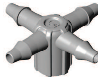
4 Way outlet