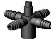
4 Way Multi Outlet